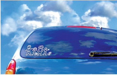
Poster – 18" x 24"